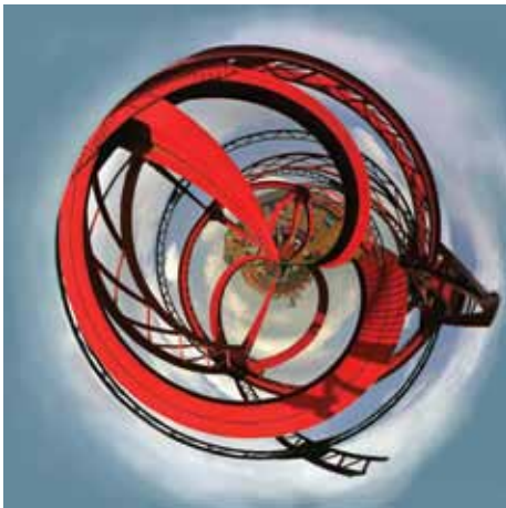
▲ Bascule Bridge, Wapping, London (2002) by Michael Boutall , who once ran the Photographic Department and lives in the English capital today.

The photographic work of alumni from London to New York was exhibited.