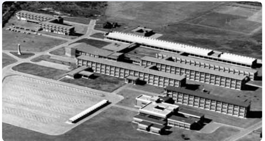
▲ AS IT WAS ... An aerial shot of the new Port Elizabeth Technikon in the late 1970s, is stark comparison to the NMMU North Campus of today with its lush, mainly indigenous gardens and extra buildings.

The architectural technology and interior design students have moved from North to South, while construction management and quantity surveying moved from South to join their fellow built environment colleagues on North Campus.