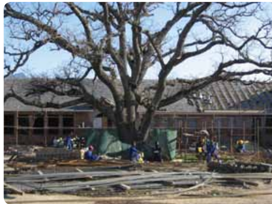
◀ NEW SURROUNDS ... The ancient oak tree opposite the original Saasveld house, Pampoenkraal, is getting some new neighbours in the form of 200- and 280-seater lecture halls, a 450-seater computer lab and a library to accommodate the School of Business and Social Science from 2009.