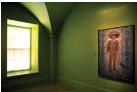
▲ Smithsonian Portrait Gallery