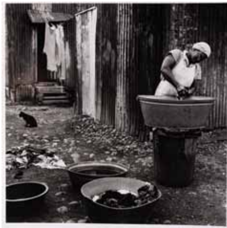
▲ Red Location by Graham Thompson , who is still lecturing photography students at NMMU.