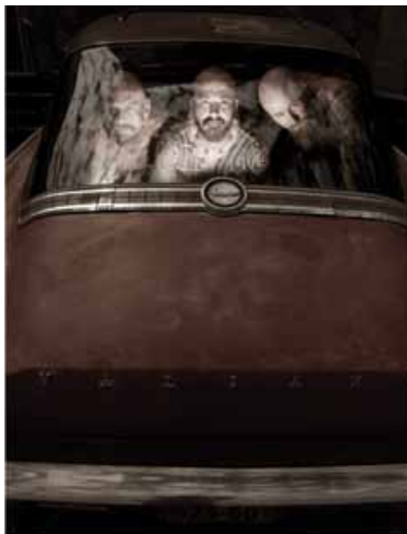
▲ Valiant by Johan Wilke , who specialises in advertising photography in Cape Town.